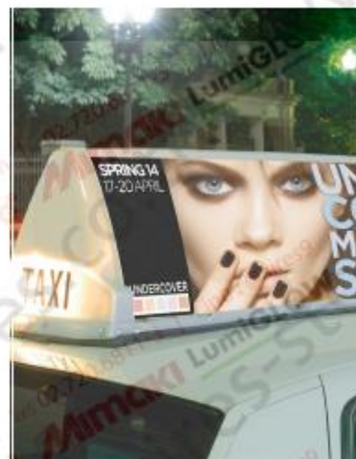
Economical liquid lamination on fleet graphics