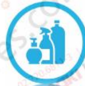
Water and chemical resistance