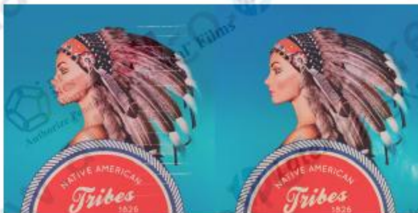
Figure 2 Scratch test prints. Image on the left shows results with eco-solvent inks. Image on the right shows results with HP 831/871/881/891 Latex Inks.

This high level of scratch resistance significantly reduces the risk of accidental damage during the finishing, installation, and display of unlaminated graphics compared to previous HP Latex Inks and competitor eco-solvent inks.