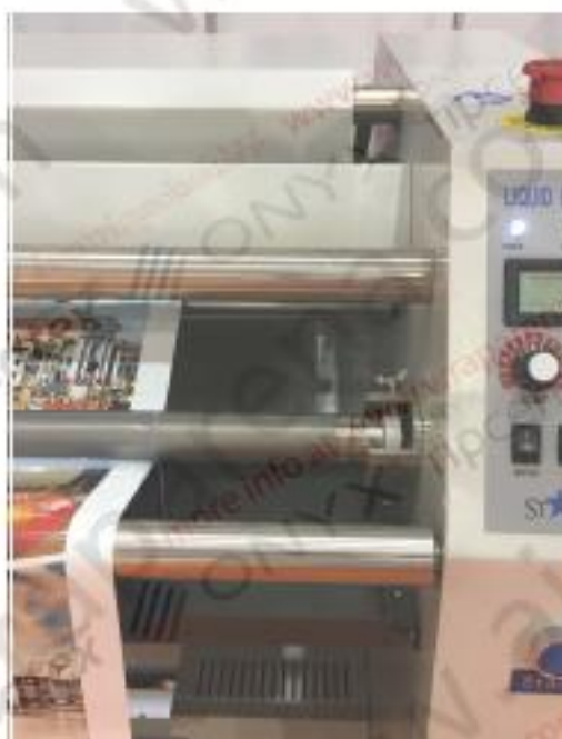
Liquid lamination on canvas