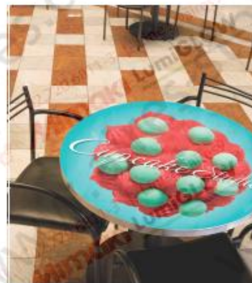
Water and chemical resistance