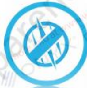
Scratch and abrasion resistance